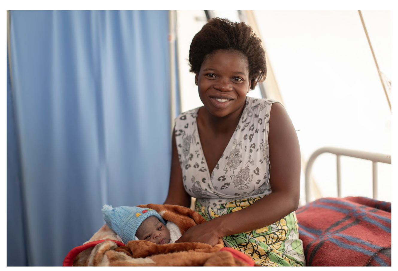
Photo: Zambia. Refugees have access to the national health system at same level as nationals.