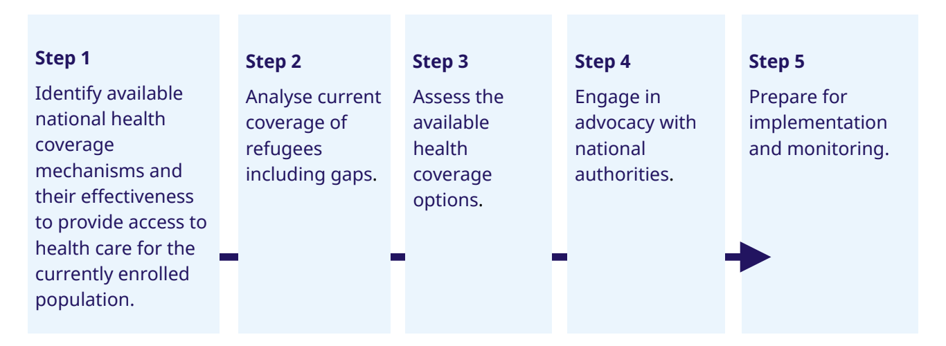
Figure 1: Steps for assessing the feasibility and possible inclusion of refugees in national social health protection

This handbook was designed with the objective of UNHCR and ILO staff working jointly on this issue. An "assessment team", ideally a joint team at country level, which can call on external social health protection support from ILO and UNHCR regional bureau and headquarters when required, should undertake the stepwise approach.