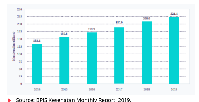
Figure 1. Coverage of Indonesia's JKN, 2014–2019

As of October 2022, JKN has covered over 246.46 million people or around 89 per cent of the population, a significant stride towards reaching Universal Health Coverage (UHC) (BPJS Kesehatan 2022) (see figure 1).