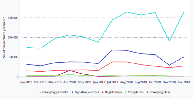
Figure 3. Usage of Indonesia's mobile JKN, 2018