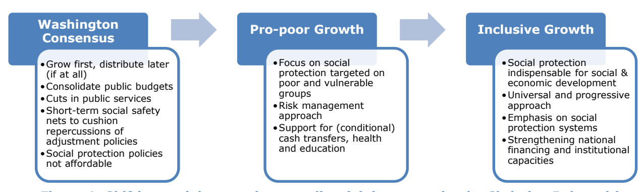
Figure 1: Shifting social protection paradigm(s) (presentation by Christina Behrendt)

Mrs. Behrendt summarized the recent paradigm shift(s) in social protection from the Washington Consensus which considered social protection as too expensive, to Pro-Poor Growth under which social protection targeted specifically poor and vulnerable groups to Inclusive Growth where social protection is seen as a vital tool for promoting growth.